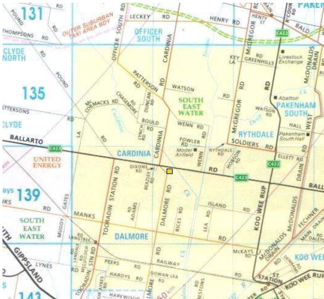
Extract of page 14 of the Melway Street Directory (ed. 32) printed with permission. Copyright © Melway Publishing Pty Ltd 2004